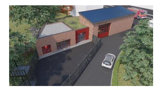
Chobham artistic impression